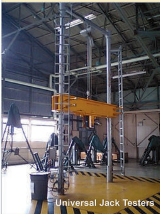
Universal Jack Testers

Rugged, simplified design permits higher net load capacities, at the same time insuring load protection under all transport conditions by virtue of the mixed springs rates involved in the combination of rails, frames and tires.