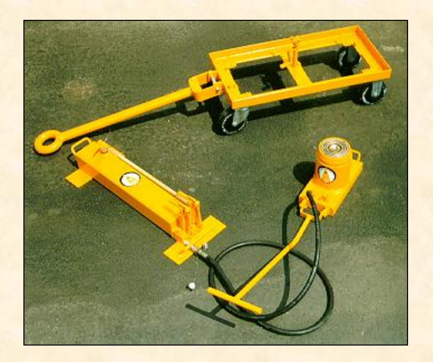
Model 8704-010 – Dual Hand Pumps Model 8704-011 – Air Pump